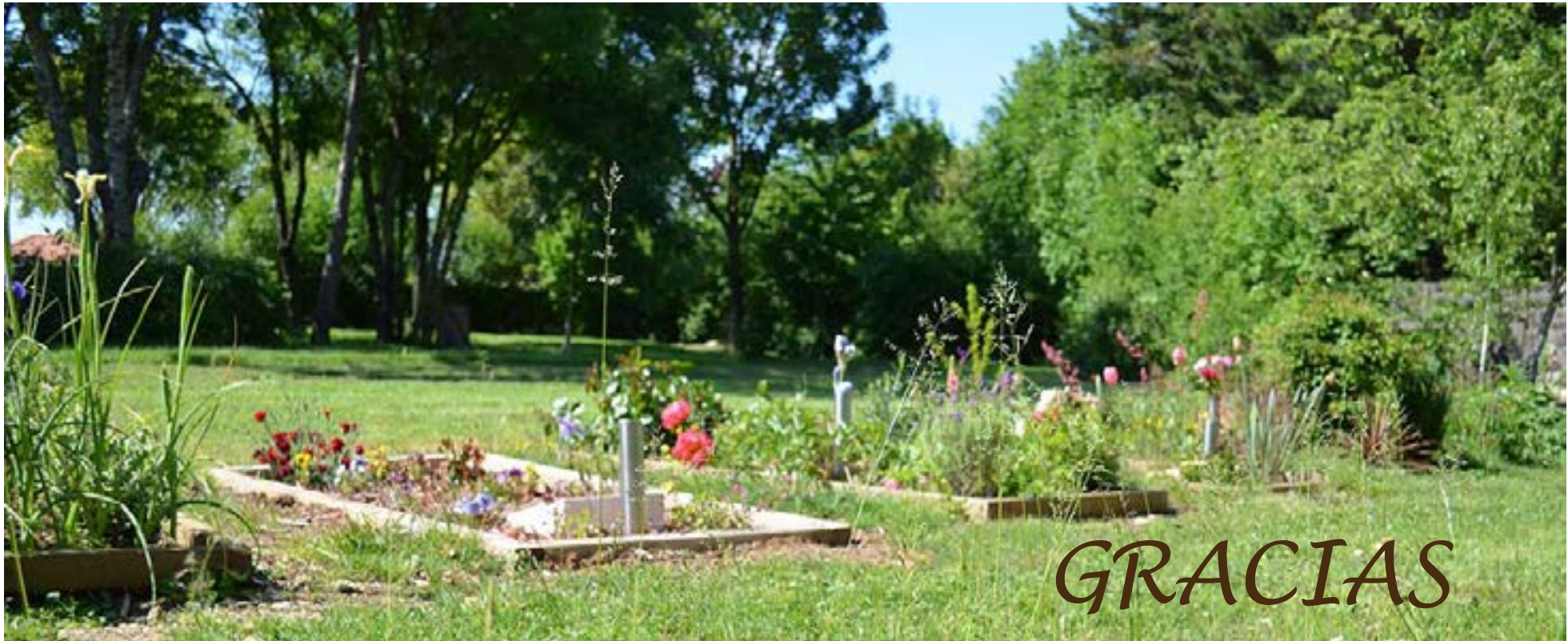
Public images of natural cemeteries of the UK, Holand y France